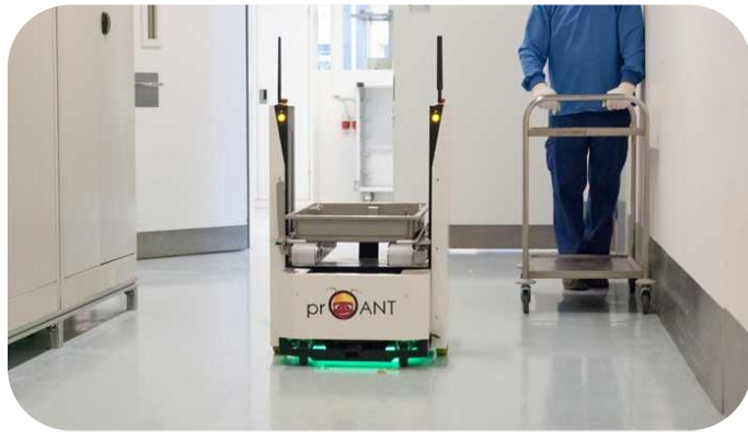
✓ Cooperative Systems