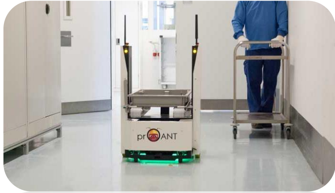
✓ Cooperative Systems