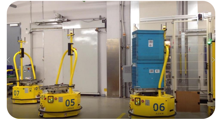
○ Self-Organizing & Self-Optimizing systems