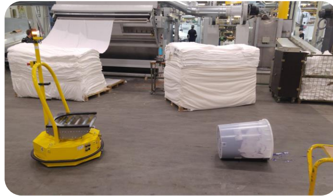
○ Collaborative Systems